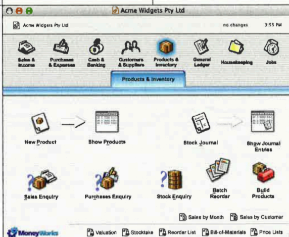
At a glance. Relevant reports are available along the lower edge of MoneyWorks' main window.

While time can be treated like a product (for example, three hours at $100 per hour), and job costing is included, there doesn't